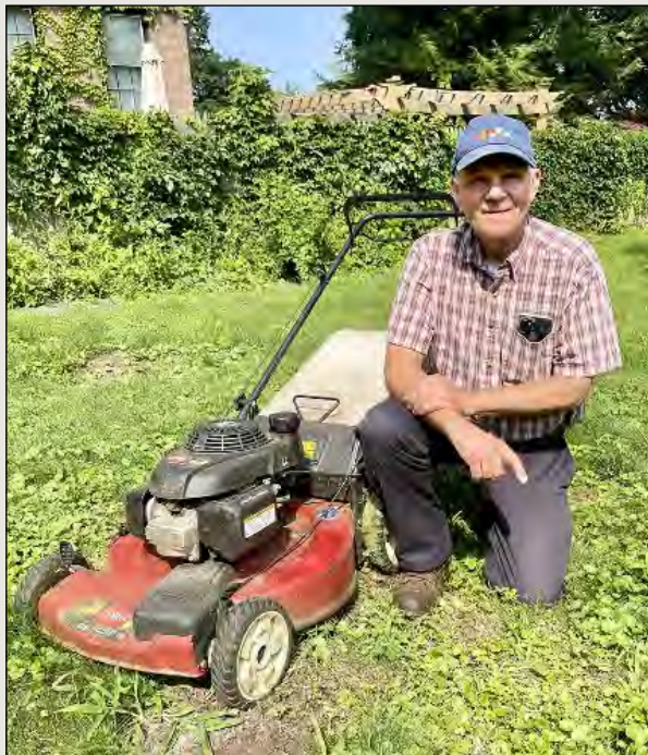
UNOFFICIAL CARETAKER: St. George's Rectory