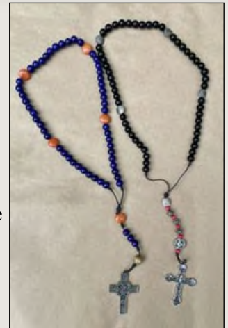
CREATIVE HOBBY: Making rosaries