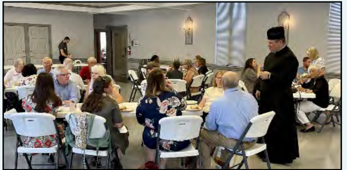
The sign up sheets for bringing food for Sunday coffee hour were filled by a variety of parishioners all summer. Thank you to everyone who made at least one Sunday a priority. New sheets for fall months will be available soon. sandee hughes