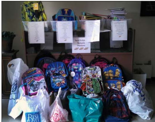
Beaucoup school supplies awaiting delivery to Things Of My Very Own.