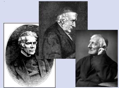
Tractarians - John Keble, Edward Pusey and John Henry Newman.

The Beginning – The Tractarians Without delving into details, we all know that the Anglican Church arose in 1534 via a schism from the Catholic Church in Rome. Catholic traditions were thus always deeply-rooted in Anglican worship. In the ensuing centuries, infighting and spiritual dry rot had infected the Church, causing a group of Oxford University clergy to preach and produce a set of tracts related to the teaching of the Christian faith as contained in the Creeds and the practice of the Church's sacramental life.