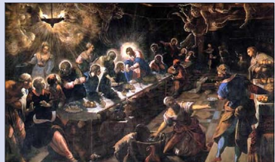
The beginning of apostolic succession. The "Last Supper", Venetian artist Tintoretto, 1518-1594

A more Protestant view of Anglicanism would say that this is all too papist and that the Church should revert to an earlier time with no vestments and little ritual, priests in a simple black cassock and surplice, standing at the north end of the altar. The pulpit - not the altar - would be the focus and Morning Prayer and Litany would dominate the weekly worship service, with the Holy Eucharist celebrated only several times each year. Gone would be the Anglo-Catholic emphasis on ceremony, altar frontals, incense, bells, holy water, genuflecting and crossing oneself. Even now, this is not uncommon.