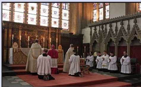
There is no mistaking the revival of Catholic ceremonial in an Anglo-Catholic church.

The Oxford Movement These efforts of these "tractarians" started a movement, which after about 50 years resulted in the revival of many ancient Catholic customs and ceremonies. They conceived of the Church as one of three branches of the One, Holy, Catholic and Apostolic Church - visibly divine as founded by Christ, to carry forth his mission on earth until the end of time. You will remember this wording in the Nicene Creed. There also were alternate views of the church either as a public institution whose purpose was to foster morals, good works and public virtue or as an evangelical society. These three conflicting views gave rise to strong divisions as to how people regarded "their" church".