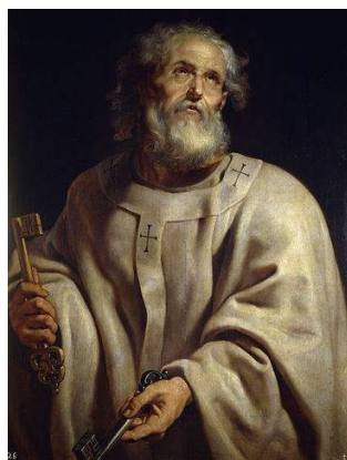
Peter, the apostle and the first bishop, a role that ultimately became the first Pope. Peter Paul Rubens, c.1611

[Matt 16:18-19] The rock was Peter and from that moment, Peter had Jesus’ authority to build the church. He and the other apostles appointed leaders wherever they went, both presbyters and bishops, “...to tend the flock of God that is your charge...” [1 Peter 5]. The apostles carried this charge to the world and became bishops and shepherds of the people, teaching them and developing their spirituality.