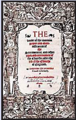
Cranmer's 1549 Book Of Common Prayer

prayer books and in spite of Henry's death in 1547, a new prayer book was released, heavily based on the ceremonies of the Roman Rite, but replacing the various Latin rites that had been used in different parts of the country with a single liturgy in English and without traces of allegiance to Rome.