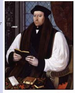
Thomas Cranmer, Archbishop of Canterbury 1533-1555 and the force behind the creation of the Book of Common Prayer

Beginnings – England, 1533 - Henry VIII was king and Henry's marriage to Catherine of Aragon had recently been annulled with the support of Thomas Cranmer, Rome's newly-appointed Archbishop of Canterbury. Cranmer's next task was to gain Rome's approval for Henry's marriage to Anne Boleyn but when that effort failed, the split of the English church from Rome was inevitable. Backed by Cranmer, Henry became the head of the new Anglican church and in 1549, after some early attempts at