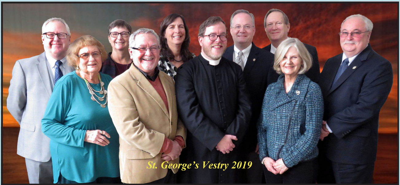
St. George's Vestry 2019