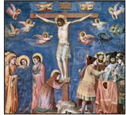
Christ crucified by Giotto circa

From a cruel death upon the cross to His glorious resurrection, Jesus' resurrection is the central doctrine of our Christian faith. After being crucified by the Romans authorities and buried by Joseph of Arimathea, Jesus was raised from the dead by God and appeared to witnesses before ascending into heaven to sit at the right hand of God. The Nicene Creed tells us "On the third day he rose again in accordance with the Scriptures".